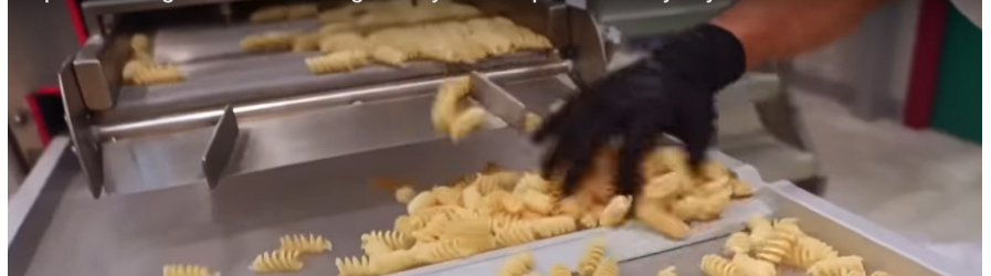
Pope Francis gave his remaining money to fund pasta factory at juvenile detention center

Click here for the story of Pope Francis' final donation and here for his video message on solidarity with people on the margins.