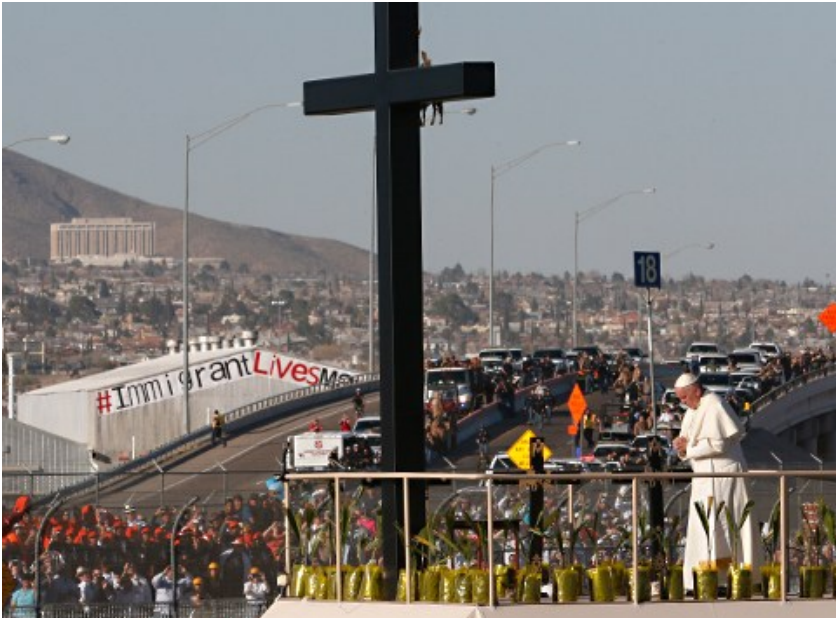
Pope Francis visiting the US/Mexico border

“I invite you not to build walls but bridges, to conquer evil with good”